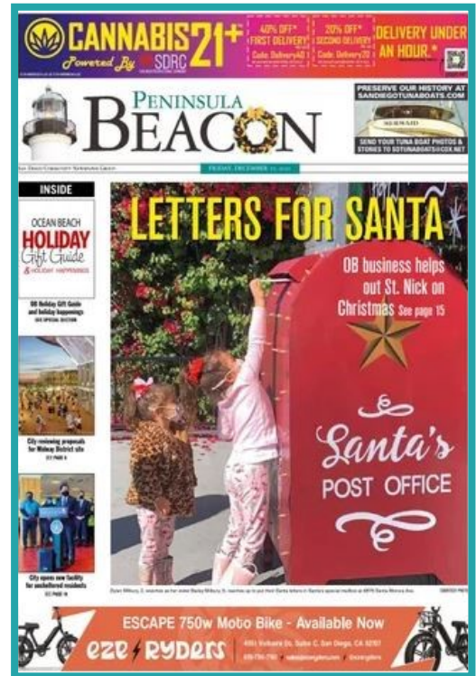
Peninsula Beacon is distributed bi-weekly to 20K Peninsula residents, plus online.