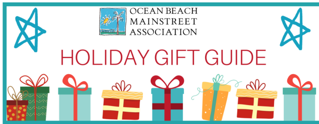
Peninsula Beacon holiday gift card is a special insert distributed to 20K residents & on online in each December.

Ocean Beach cooperative advertising opportunities can create a presence for your business at a significantly lower price point than advertising on your own. The OBMA purchases advertising throughout the year to promote Shopping, Dining, Playing, Staying & Living in Ocean Beach and ad opportunities in various printed and online publications are available to OBMA members.